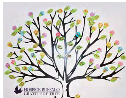
Gratitude Tree, started by our Wellness Committee, displays staffs', patients' and visitors' expressions of gratitude each season.