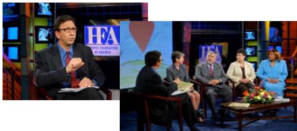
HFA's 2009 Living With Grief: Diversity and End-of-Life Care Panelists

The 2010 teleconference will address care options related to cancer diagnoses as well as loss and grief reactions for patients, families and professional care-givers. The teleconference will also examine psychosocial aspects of cancer, pain management, and ethical issues related to the disease.