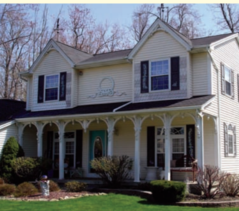
West Herr Guest House on Hawthorne Street.